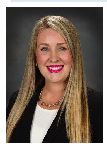
RCRW Membership Dinner and Block Party

March 18, 2022-Doors open at 7:00 P.M. At The Center