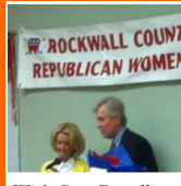
With Sen. Deuell