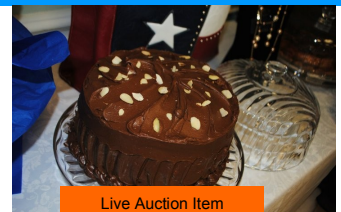
Live Auction Item